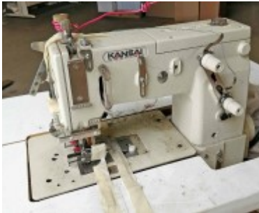
Kansai Special Model DLR-1501PHD Single Needle Chain Stitch $650.00