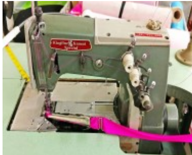
Kansai Special 2 Needle Cover Stitch Machine Set up as a binder $425.00