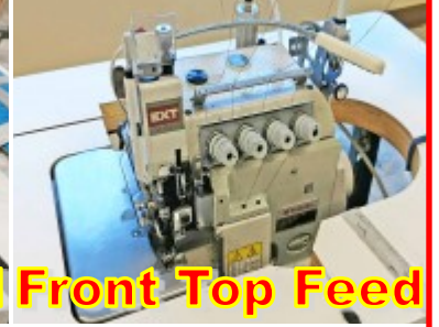
Pegasus Model EXT-5214 4 Thread Top Feed Serger $1,295.00