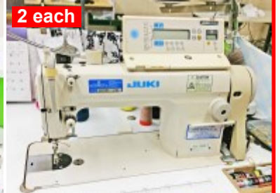
Juki Model DDL-8500-7 Single Needle Lockstitch Full Automatic Functions, 220v $795.00 each