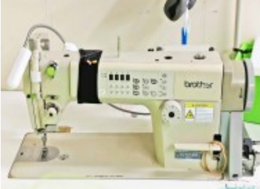
Brother Model SL-737 Single Needle Lockstitch Full Automatic Functions, 220v $750.00