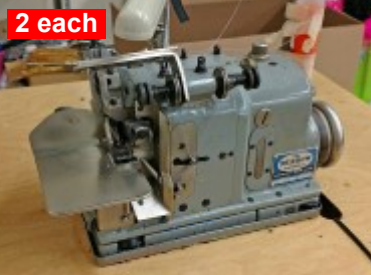
Merrow Model M-3DW-2 3 Thread Serger $290.00 each