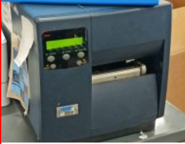
Datamax Label Printer Model DMX-I-4208 $295.00 each