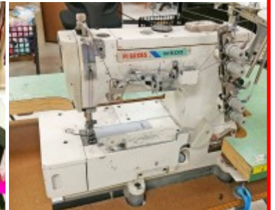
Pegasus Model W562 Flatbed Cover Stitch 3 Needle Sewing Machine $695.00