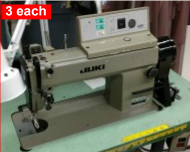
Juki Model DDL-5550-6 Single Needle Lockstitch Full Automatic Functions, 220v $325.00 each