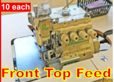
Yamato Model AZF-8020G 4 Thread, Top Feed Serger Chain Cutter & Waste Removal $1,095.00 each