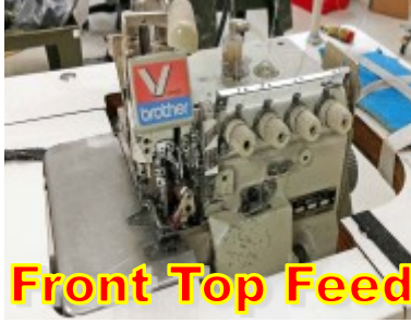
Brother Model MA4-V82 4 Thread Top Feed Serger $525.00