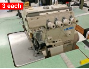
Juki Model 6714/3714 4 Thread Serger $795.00 each